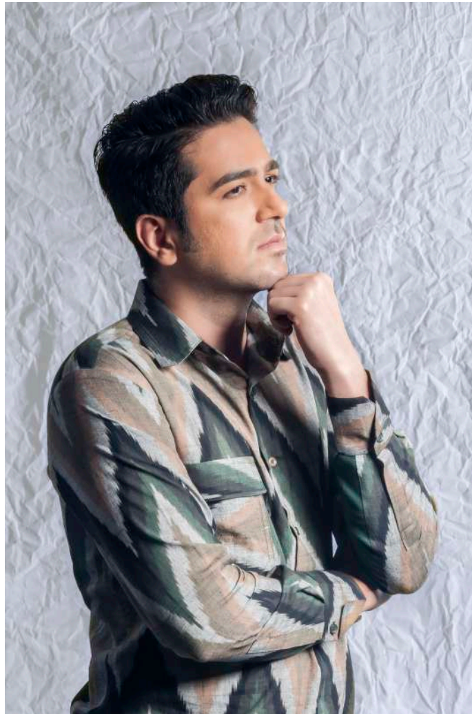
◀ Bomber shirt