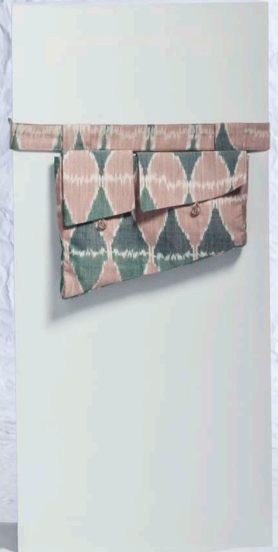
Belted fanny pack ►