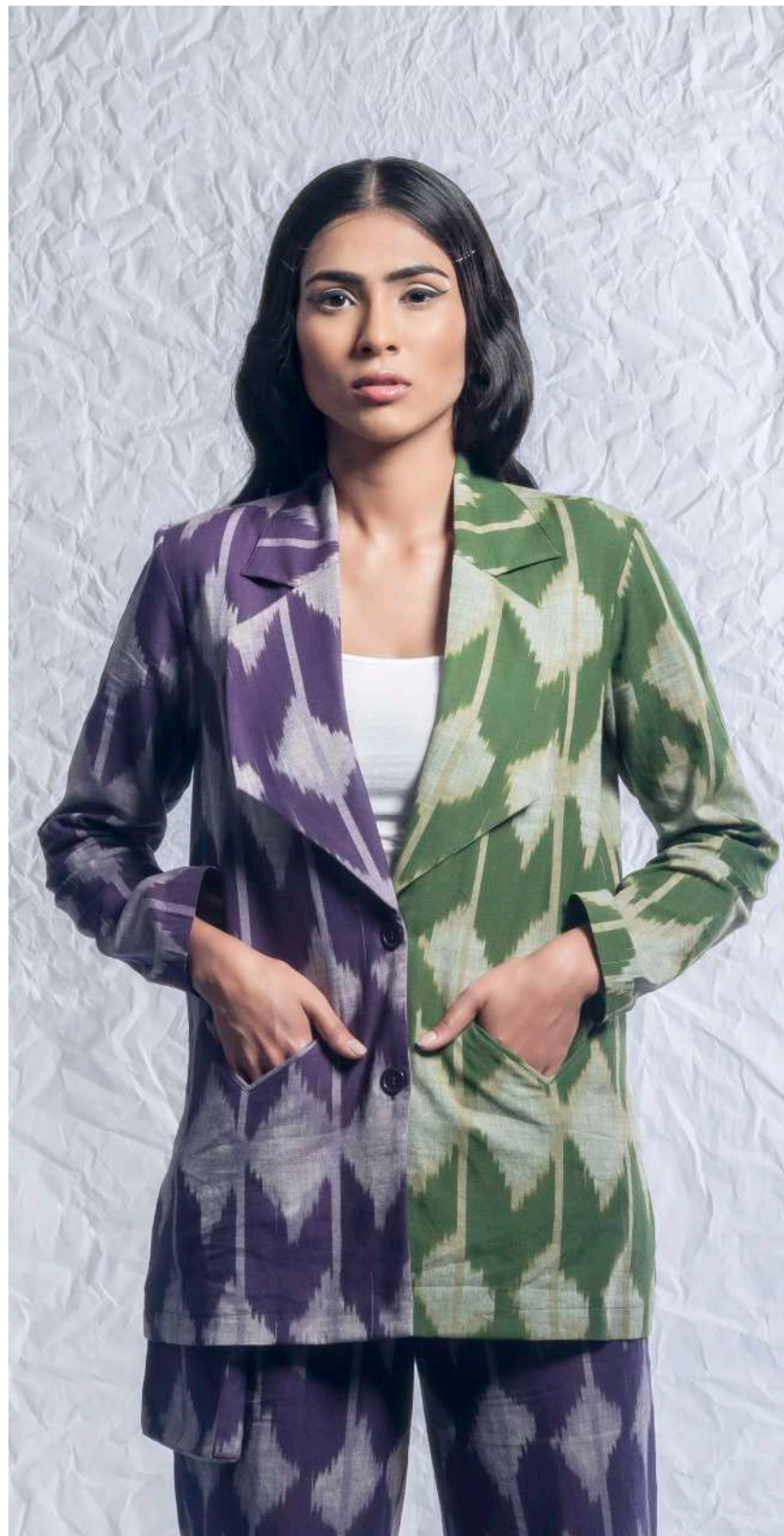
◀ Half and half jacket