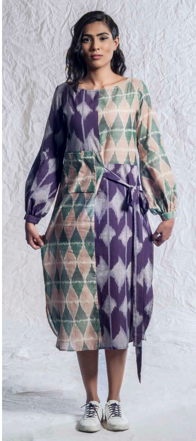
◀ Half and half midi