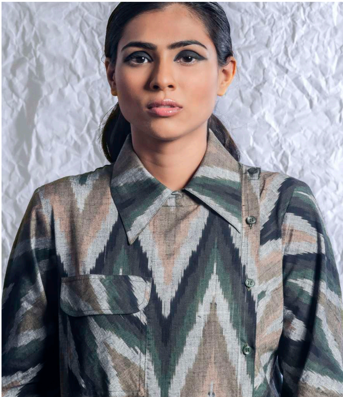
Shirt midi ►