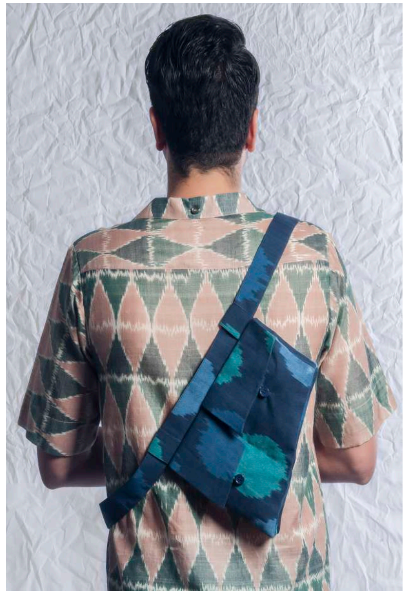
▲ Cuban collar shirt