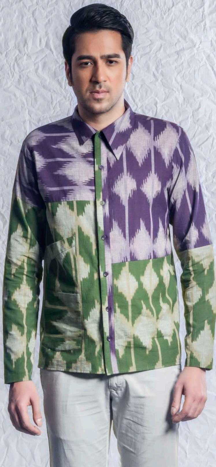
◀ Half and half shirt