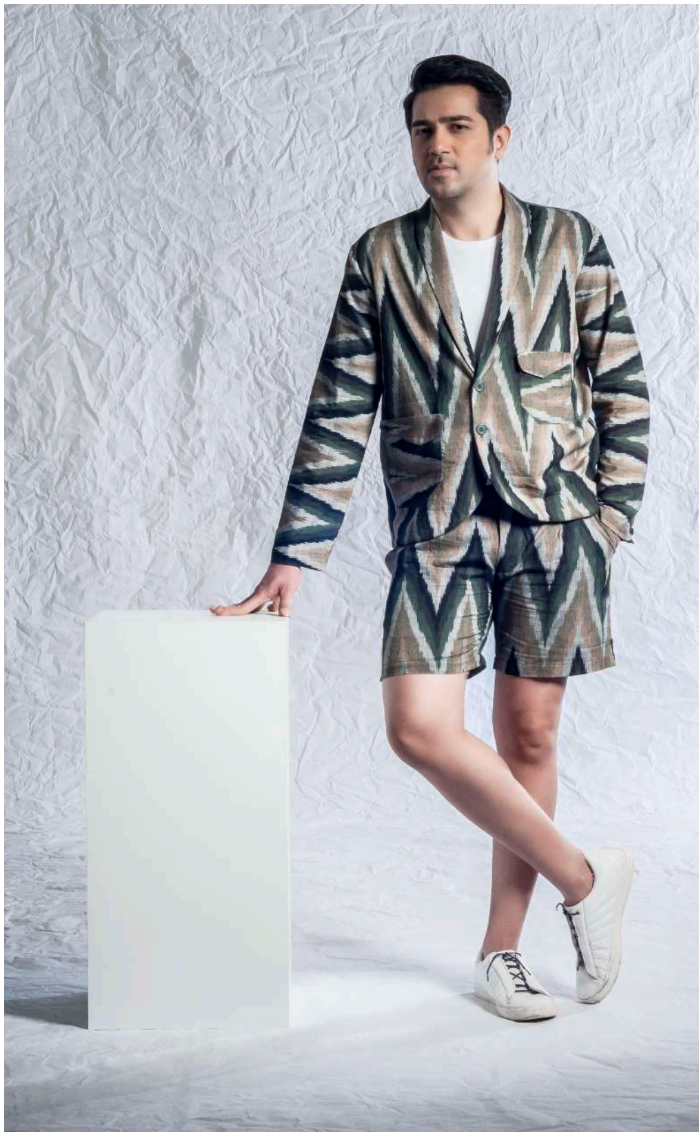
◀ Jacket with asymmetric pockets