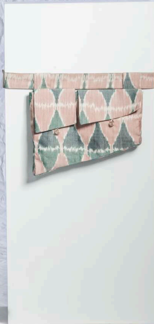
◀ Two pocket fanny pack